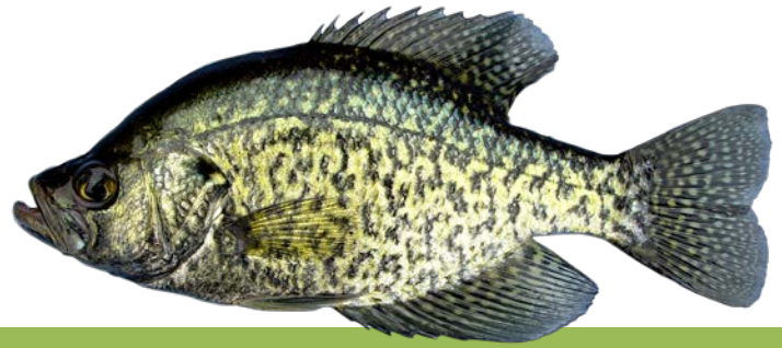
Black Crappie ( Pomoxis nigromaculatus )